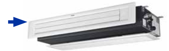
PAD0890SA Optional supply air grille for Slim Duct models: MVAD007MV2AA MVAD009MV2AA MVAD012MV2AA