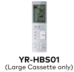
YR-HBS01 (Large Cassette only)