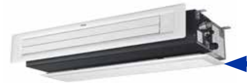
PAD0890RA (with filter) Optional return air grille for Slim Duct models: MVAD007MV2AA MVAD009MV2AA MVAD012MV2AA