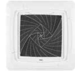
PB-950KB Panel for 3'x3' MRV Cassette Must order PB-950KB separately with the purchase of Large Cassette models: MVAL009MV2AA MVAL012MV2AA MVAL018MV2AA MVAL024MV2AA MVAL030MV2AA MVAL036MV2AA MVAL042MV2AA MVAL048MV2AA